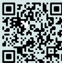
Facebook Fan Page QR Code